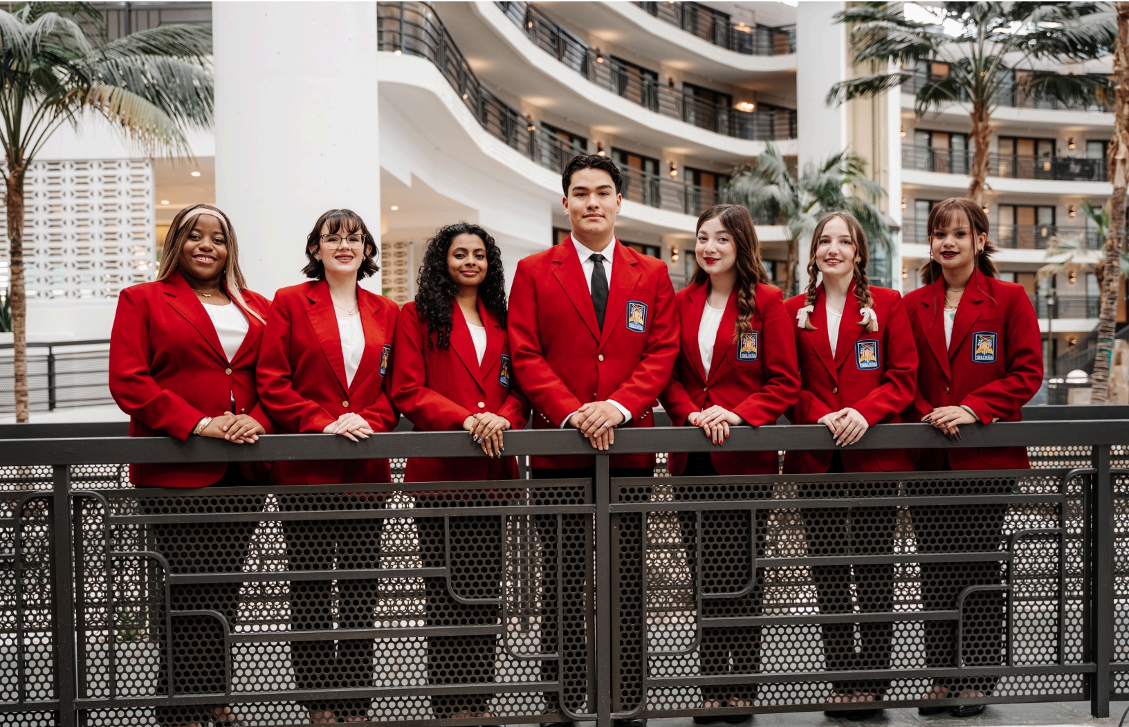
2025-2026 State Officer Team